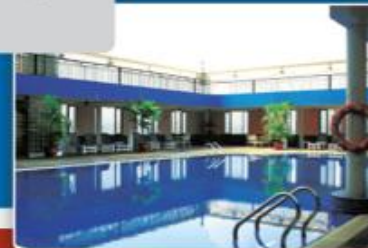
Premium Serviced Apartments