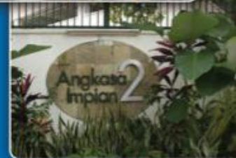
ELC Student Apartments