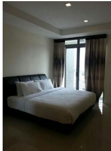
Master Room (Single)