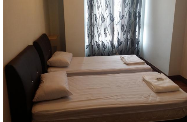
Middle Room (Twin Sharing)